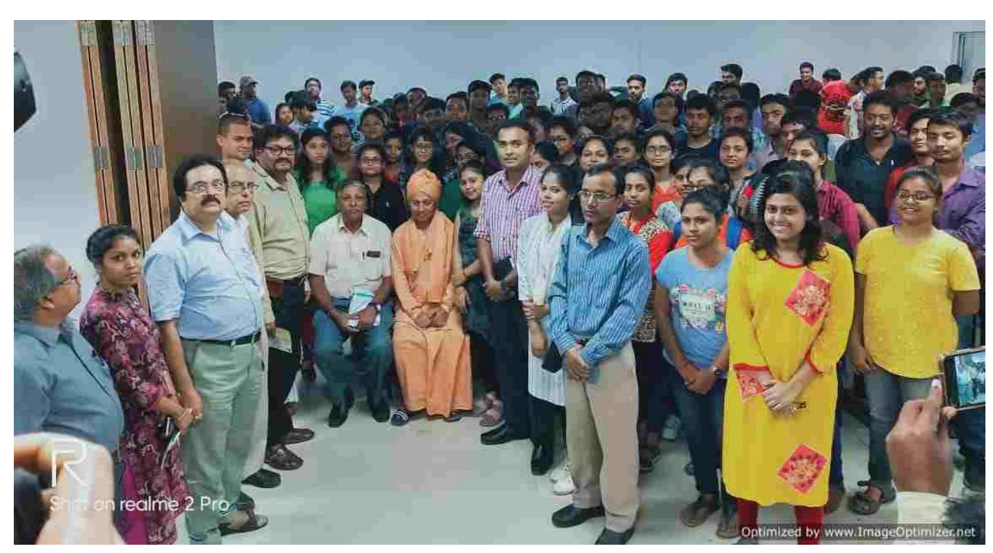
Page :: 4 :